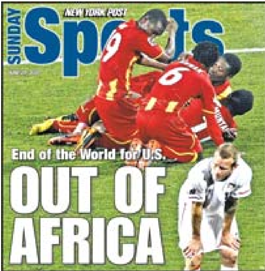
The Yankees' journey as players from around the world join after the United States' 2-1 World Cup loss in extra time yesterday in Johannesburg, South Africa. The national team (above) lost Ghana to the quarterfinals and the U.S. home #4485-111-1088

BBC TICKER: Manchester United is weighing up a bid for Chilean livewire forward ALEXIS SANCHEZ ...