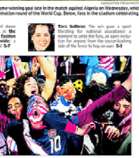
A crowd of fans celebrating the U.S. victory.

Thirty minutes of drama and action ends in the most dramatic fashion as the U.S. secures a 1-0 victory over Algeria. The goal was scored by Landon Donovan in the 35th minute of the match.