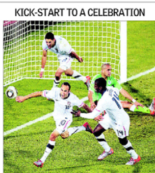
Landon Donovan celebrating his game-winning goal in the match against Algeria on Wednesday, which moved the U.S. through to the elimination round of the World Cup. Soccer fans in the stadium cheering.

A magnitude 2.9 earthquake centered under New Jersey on Wednesday, June 23, rattled buildings in New Jersey, Pennsylvania and Maryland. The earthquake was felt by many people in the Philadelphia area. The quake was felt by many people in the Philadelphia area. The quake was felt by many people in the Philadelphia area.