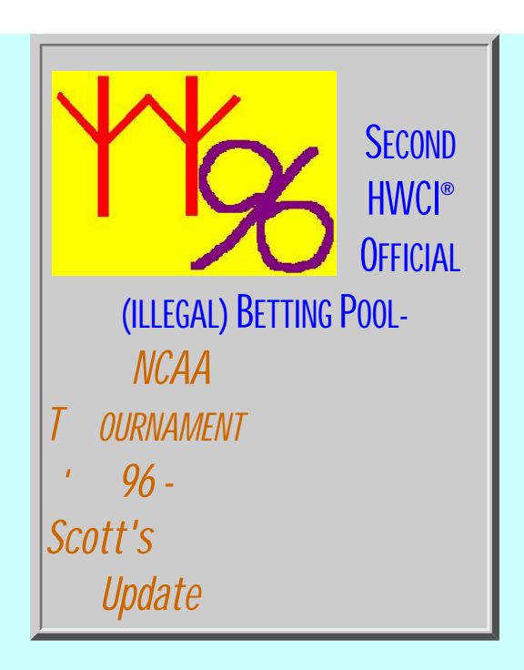
3/21/96, Issue # 9.3.1 "Wake Forest survives scare; Pool down to 12"