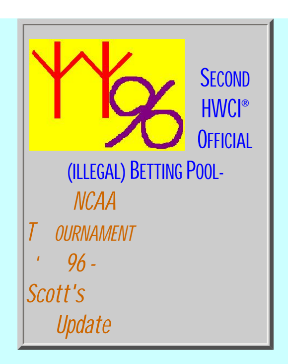
3/23/96, Issue # 11.4.1 "Hoyas loss narrows field"