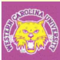
Western Carolina U. Catamounts