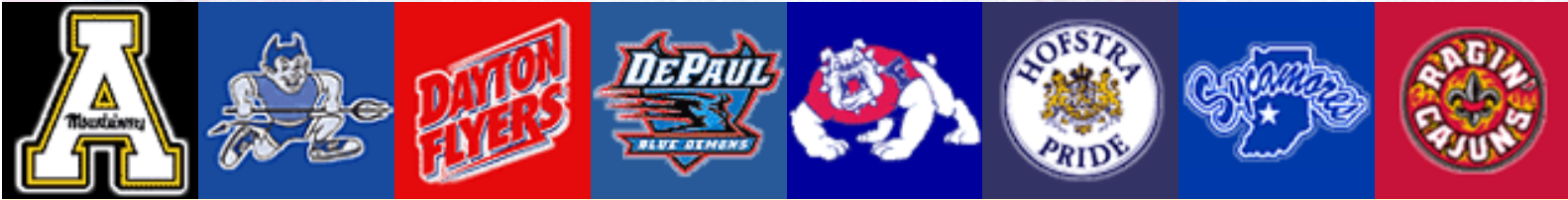
Appalachian St. U. Mountaineers